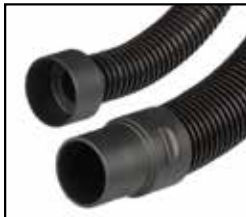
Inlet accepts 1/4" and 2/2" diameter hoses