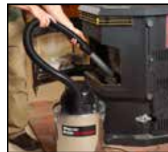
Cold furnace ashes