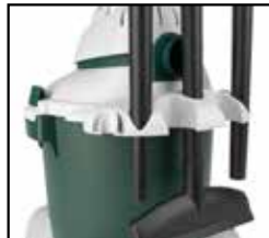
On board tool storage keeps you organized