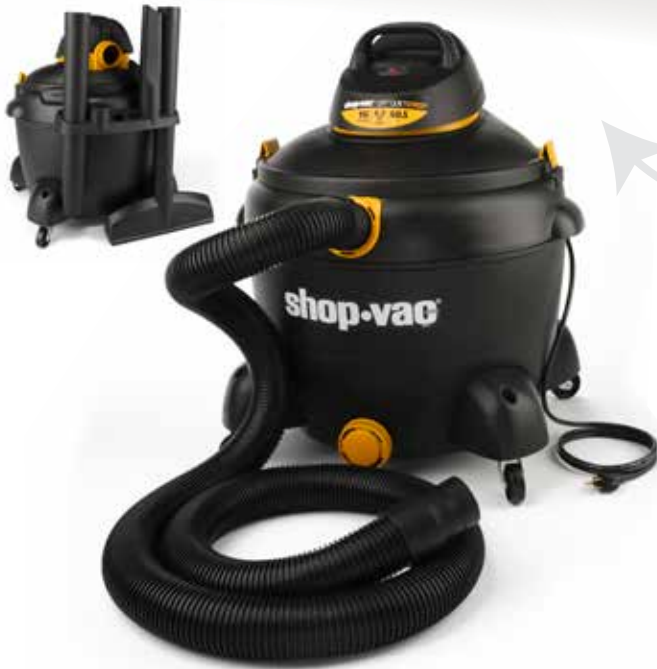
5983300 16 U.S. Gallons*, 60.5 Liters* 6.5 Peak HP†

3 Both vacs backed by a three year warranty