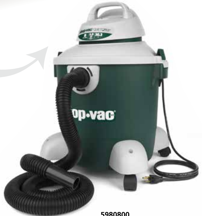
5980800 8 U.S. Gallons*, 30.3 Liters* 3.0 Peak HP†