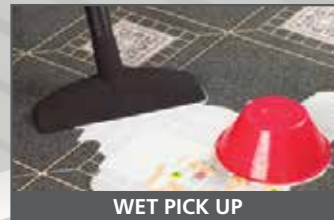
WET PICK UP