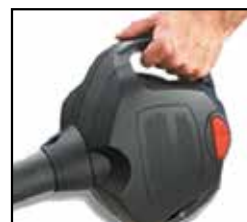
Handheld detachable blower