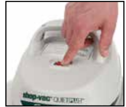
Convenient on/off switch