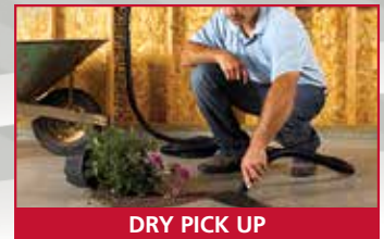
DRY PICK UP