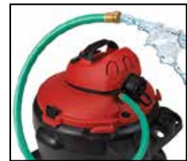
PUMP IT OUT