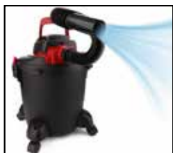
Powerful rear blower