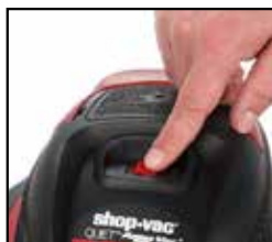
Convenient on/off switch