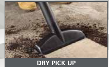
DRY PICK UP

These wet/dry vacs offer the greatest range of quiet power. From 3.0 to 6.5 peak horsepower†, the Quiet Deluxe series offers the maximum power you need for the toughest messes... wet or dry.