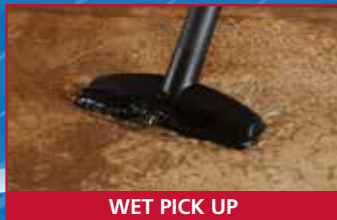
WET PICK UP