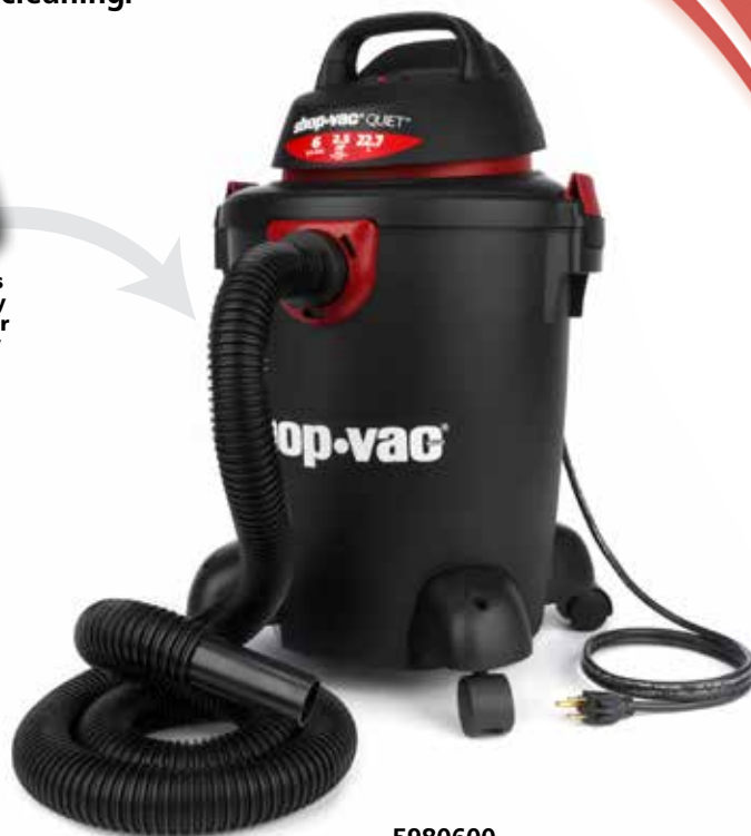
5980600 6 U.S. Gallons*, 22.7 Liters* 2.5 Peak HP†