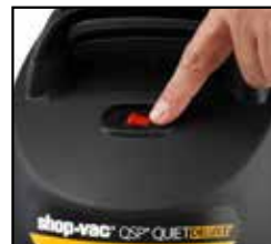
Convenient on/off switch

All vacs backed by a three year warranty