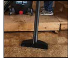
PICK IT UP