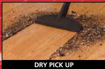
DRY PICK UP

The economical choice to give you the power to take the work out of cleaning.