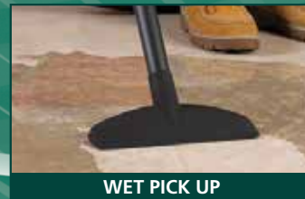
WET PICK UP

This Blower Vac gives you a wet/dry vacuum that can also be converted into a handheld, detachable blower.