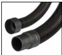
Inlet accepts 1¼" and 2½" diameter hoses