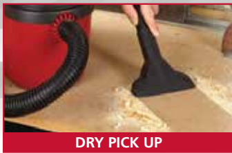
DRY PICK UP