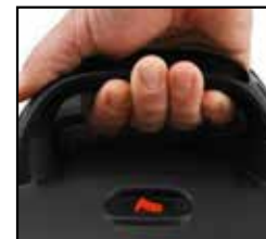
Built in top carry handle