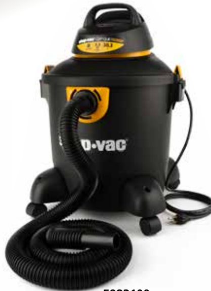
5983100 8 U.S. Gallons*, 30.3 Liters* 3.5 Peak HP†