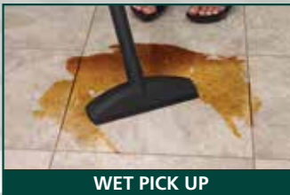
WET PICK UP