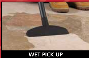
WET PICK UP