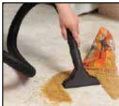
Quick kitchen spills