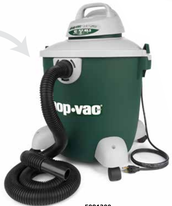
5981200 12 U.S. Gallons*, 45.5 Liters* 4.5 Peak HP†