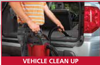
VEHICLE CLEAN UP