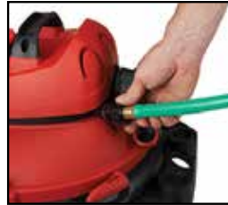
HOOK IT UP