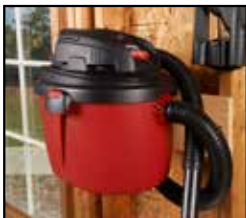
Convenient wall mounting bracket

2036000 2.5 U.S. Gallons*, 9.4 Liters* 2.5 Peak HP †