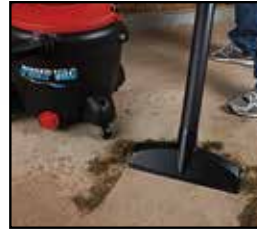
Dry pick up

5821600 16 U.S. Gallons*, 60.5 Liters* 6.0 Peak HP†