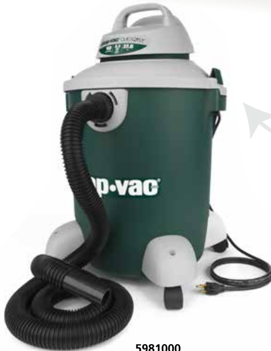
5981000 10 U.S. Gallons*, 37.8 Liters* 3.5 Peak HP†