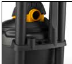
Convenient tool storage (not standard on all models)