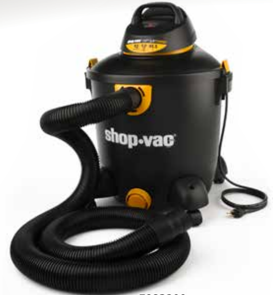
5983200 12 U.S. Gallons*, 45.5 Liters* 5.0 Peak HP†