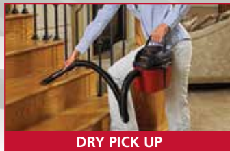
DRY PICK UP