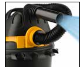
Powerful rear blower