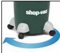
360° Easy glide caster system