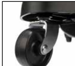
Heavy duty casters