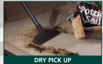
DRY PICK UP

These wet/dry vacs offer an even greater range of quiet power. With motors ranging from 2.75 to 4.5 peak horsepower†, we can equip you with the power you need, for any mess... wet or dry.