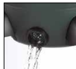
Extra large tank drain