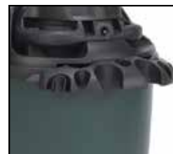
On board tool storage keeps you organized