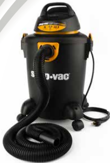
5983000 6 U.S. Gallons*, 22.7 Liters* 3.0 Peak HP†

These wet/dry vacs offer the greatest range of quiet power. From 3.0 to 6.5 peak horsepower†, the Quiet Deluxe series offers the maximum power you need for the toughest messes... wet or dry.