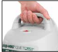
Built in top carry handle