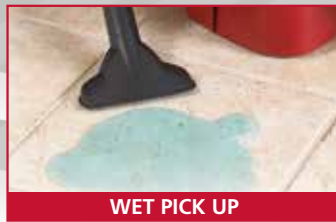
WET PICK UP