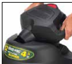
Detachable blower, quick and easy

Accessories: 7' (2.1 m) x 1 1 / 4 " (3.2 cm) Lock-On® hose, (3) 1 1 / 4 " (3.2 cm) extension wands, 10" (25.4 cm) wet/dry nozzle, (1) 2 1 / 2 " (6.4 cm) extension wand, concentrator nozzle, blower nozzle, tool holder, foam sleeve and ProLong® cartridge filter.