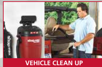
VEHICLE CLEAN UP