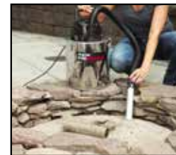
Outdoor fire pits