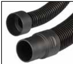
Inlet accepts 1¼" and 2½" diameter hoses