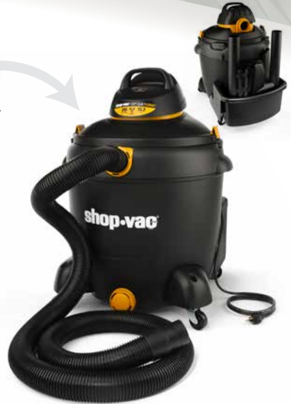
5983400 20 U.S. Gallons*, 75.7 Liters* 6.5 Peak HP†

3 Both vacs backed by a three year warranty