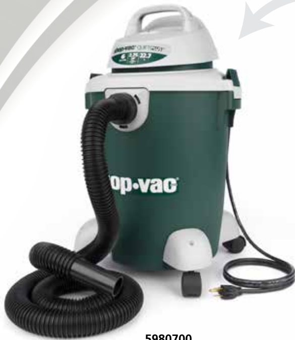
5980700 6 U.S. Gallons*, 22.7 Liters* 2.75 Peak HP†

These wet/dry vacs offer an even greater range of quiet power. With motors ranging from 2.75 to 4.5 peak horsepower†, we can equip you with the power you need, for any mess... wet or dry.