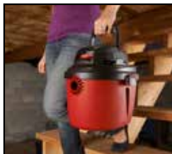
Lightweight and portable