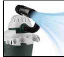
Powerful rear blower