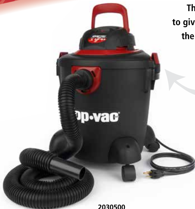
2030500 5 U.S. Gallons*, 18.9 Liters* 2.25 Peak HP†

The economical choice to give you the power to take the work out of cleaning.